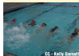
Swimming at Canberra Pool Cost: $4.70