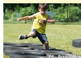
FFIT Program Don't forget your towel & drink bottle

Please bring MyWay card and Companion Card each day.