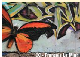
Art & Craft Canvas String Art Graffiti