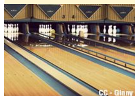
Bowling Cost: $6.95