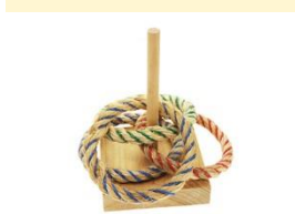
Bottle Ring Toss Game