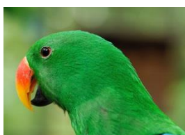
Canberra Walk-in Aviary Cost: $11.50

Please bring a packed lunch or money for lunch