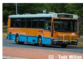
Travel Training: Bus to AMF Belconnen

Please bring a packed lunch or money for lunch