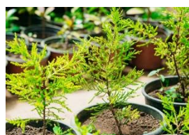
Australian National Botanic Gardens

Please bring a packed lunch or money for lunch