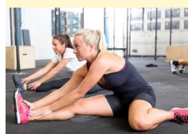
FFIT Program Don't forget your towel & drink bottle!