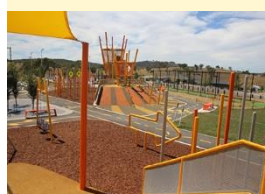
Sports at the Moncrieff Park