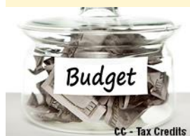
Money & Budgeting Skills