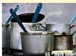
Kitchen Safety Skills