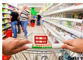
Meal Planning & Shopping