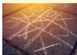
Outdoor Tic Tac Toe