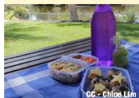
Picnic Lunch at the Park