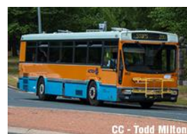
Travel Training: Bus Trip to Civic Bring Myway Cards

Please bring a packed lunch or money for lunch